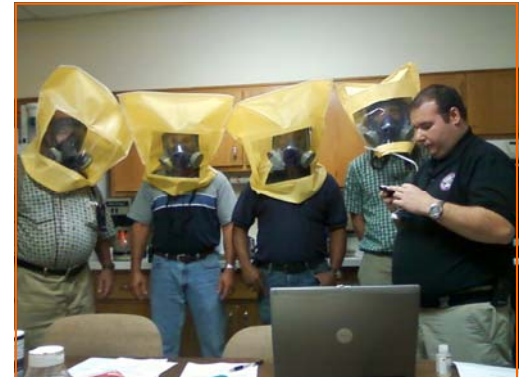
Below: Fit Testing at NWWTP