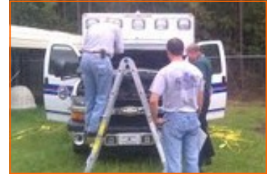
Left: Forensic Inspection

The renovations and move went smoothly with lots of work and no accidents. Great job to all!